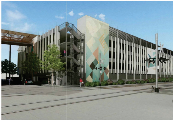
PREVIOUS CORNER SKETCH

I reviewed the proposed changes to the parking structure. - see sketch illustrations below. Major changes include: